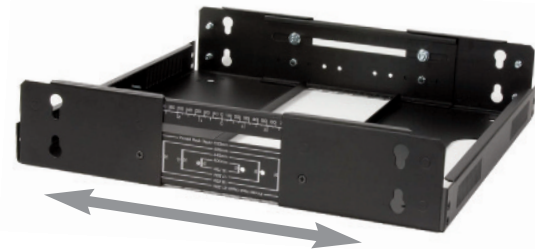
The VARI-RACK's top and base ship pre-assembled except for the depth which is selected during assembly.

The VARI-RACK™ is an innovative design that allows a custom fit on-the-fly with a top/base that can be set to any depth between 21" and 28" and corner post rails with printed marks to guide field cuts if height needs trimming. Made to fit where a standard rack won't, the Vari-Rack is great for use in cabinets, closets or credenzas. Ships unassembled.